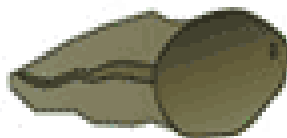
Day 12 - Tadpole with operculum