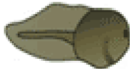
Day 6 - Tadpole with External Gills