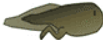
Day 70 - Tadpole with Hindlimbs