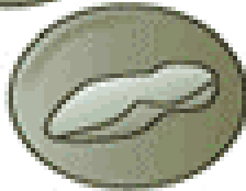
Day 3-4 - Tailbud